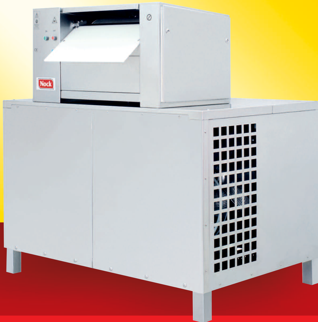
NOCK NRE 2800