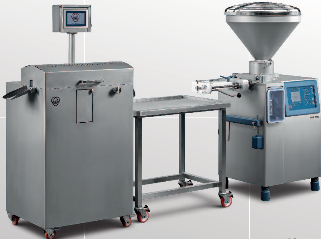
RS 280 stand-alone version