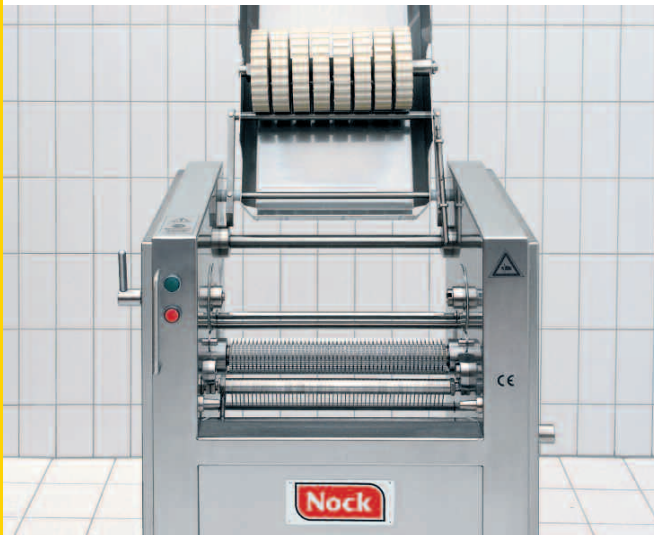
Quick and easy to clean: NOCK derinder after removing conveyor, pressure roller and blade holder. Scraper comb tilted back.

Conveyors, pressure roller, blade holder, exchangeable tables and output sheets can be removed and replaced for cleaning purposes from the machine within seconds without any tools. Therefore soiled parts are easily accessible. The scraper comb can be tilted downwards, the transport roller can be turned by hand. The conveyor frames can be folded back so that the inside of the conveyor can be cleaned. The belts can also be easily removed from the frames for thorough cleaning. The machines can be optionally equipped with plastic modular belts.