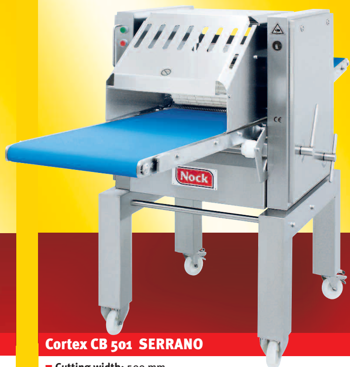
Cortex CB 501 SERRANO