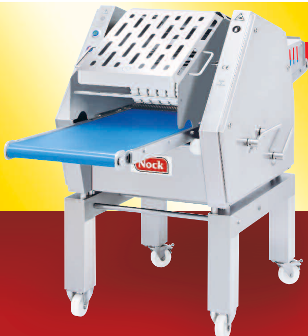
Cortex CB 519