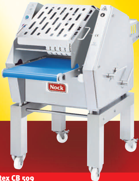
Cortex CB 509

The conveyORIZED NOCK derinding machines for industrial use are equipped with long conveyors and operate with high cutting speeds. They may not be operated in open top (manual) operation.